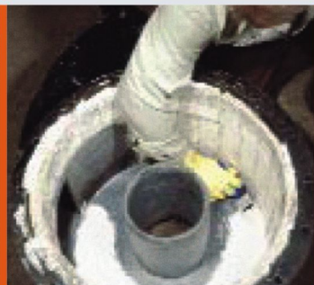
Inner Base of Dust Collector Coated with Aluma-Coat TW