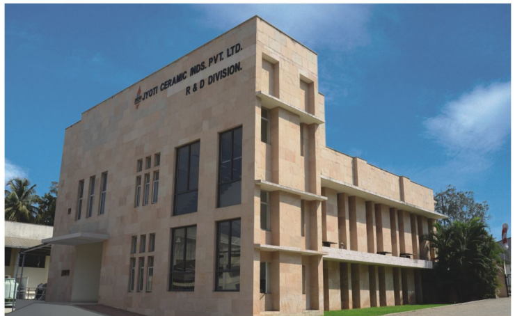
R & D Division