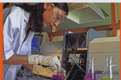
Atomic Absorption Spectrometer