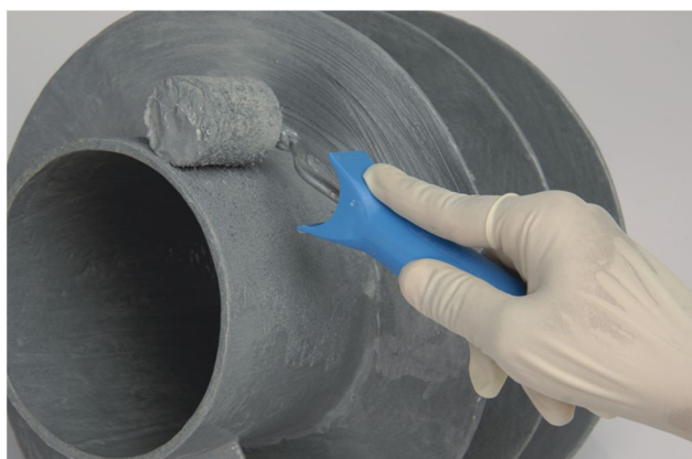
Aluma-Coat BR (Brushable)