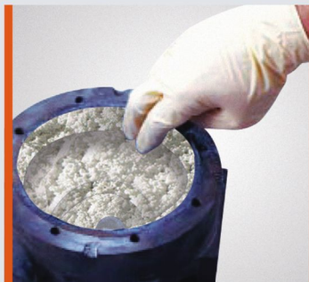
Slurry Lines Coated with Aluma-Coat TW