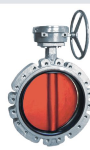
Lug-style Butterfly Valve Coated with Aluma-Coat BR