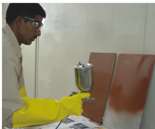
Aluma-Coat BR (Sprayable)

USP: A corrosion, abrasion and chemical resistant coating.