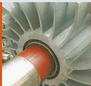
Motor Shaft Coated with Aluma-Coat BR