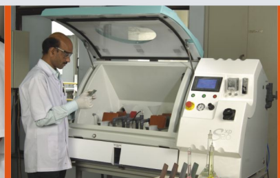
Salt Spray Analyser