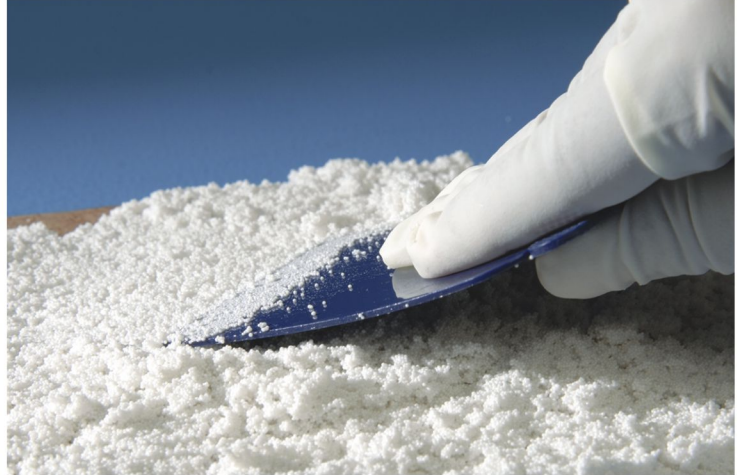
Aluma-Coat TW (Trowelable)

USP: Converts soft surfaces to abrasion and corrosion resistant.