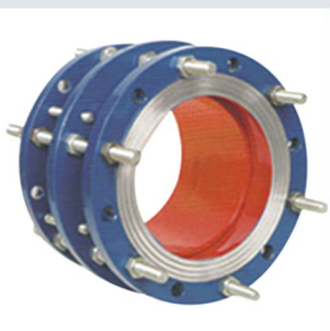
Expansion Joint Coated with Aluma-Coat BR